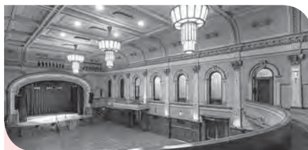
The Hawthorn Arts Centre has been beautifully restored.

Community celebrations to mark the opening of the revitalised Hawthorn Arts Centre took place on the weekend of 22 to 24 November. The celebrations featured a spectacular variety of events including a concert and a Let's Get Started: Open Day, offering a range of arts and cultural programs to suit everyone.